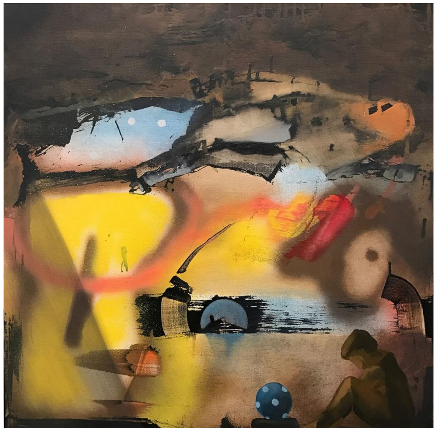
'Dreams Between War and Beach', 2017, 48x48" Oil enamel on canvas