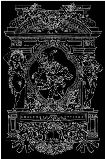
Nicolas Buffe, 2009